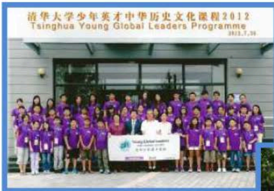
YGL 2012 Group Photo in front of COACE

为了推广汉语教学和中国文化，促进学术交流，加强学生在跨文化及专业方面的国际交往，清华大学为海外学生开设了了‘中国文化与普通话（汉语）课程’。本课程历时 20 余年，为学员创造良好舒适的学习环境，配备优质师资，旨在提高学员的汉语水平，增强学员对中国社会文化的了解，促进国际间的交流与合作。