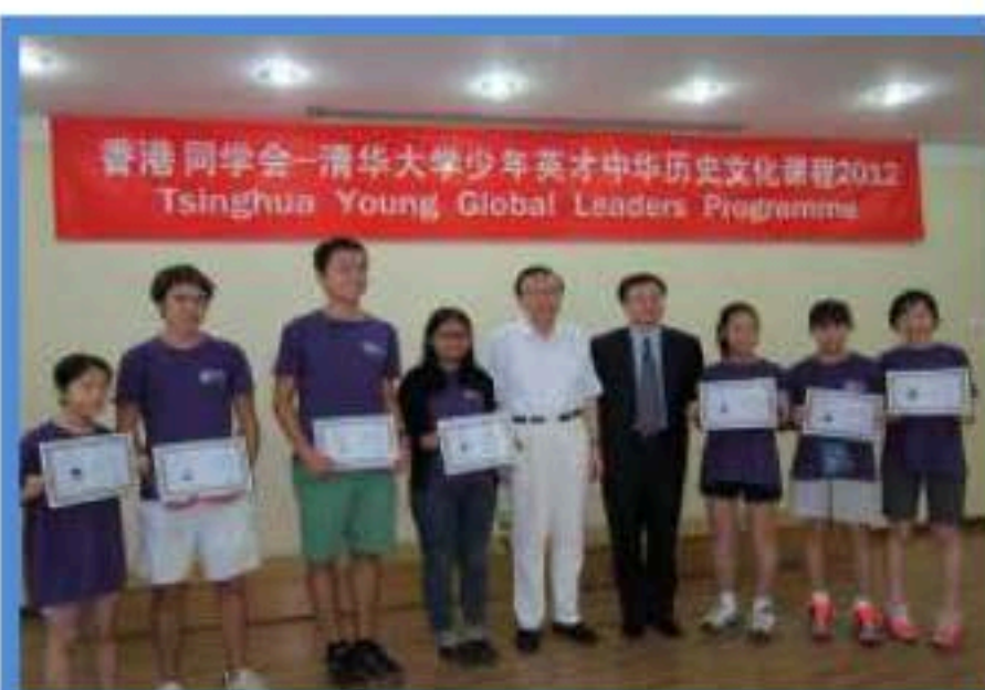
YGL 2012 Students receiving their certificates from Tsinghua Headmaster