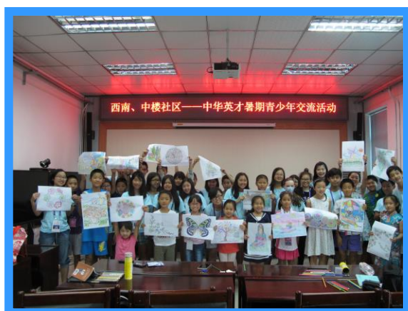
YGL 2015 Group Photo at the community service