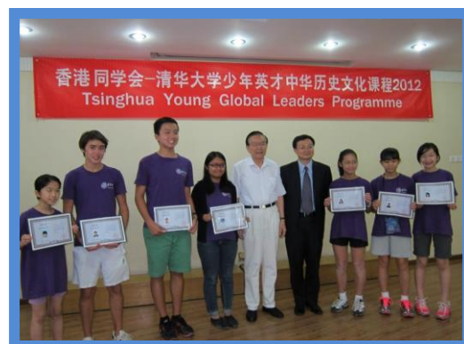
YGL 2012 Students receiving their certificates from Tsinghua Headmaster