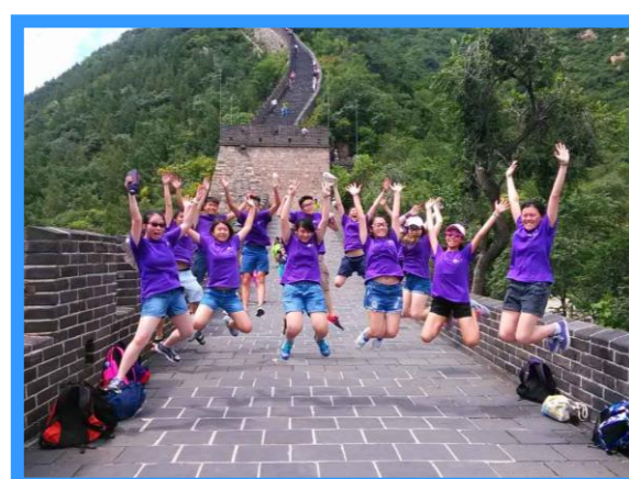
YGL 2016 Students visiting the Great Wall