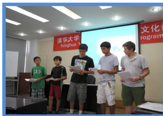
YGL 2013 Students presenting in class