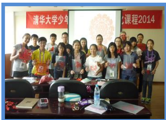
YGL 2014 Students learning paper cutting