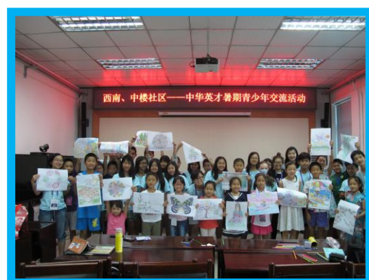
YGL 2015 Group Photo at the community service