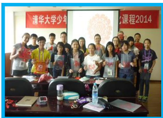
YGL 2014 Students learning paper cutting