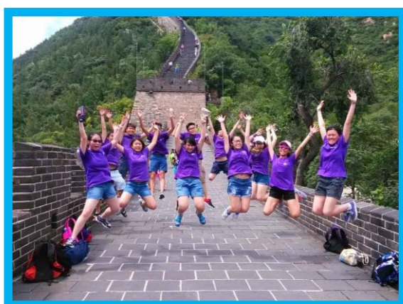
YGL 2016 Students visiting the Great Wall