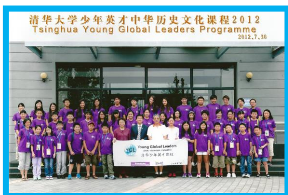
YGL 2012 Group Photo in front of COACE

为了推广汉语教学和中国文化，促进学术交流，加强学生在跨文化及专业方面的国际交往，清华大学为海外学生开设了‘中国文化与普通话（汉语）课程’。本课程历时 20 余年，为学员创造良好舒适的学习环境，配备优质师资，旨在提高学员的汉语水平，增强学员对中国社会文化的了解，促进国际间的交流与合作。