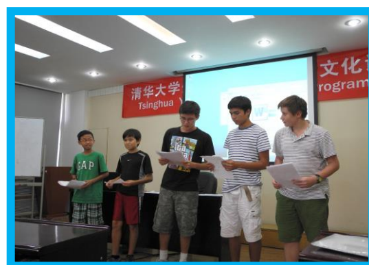
YGL 2013 Students presenting in class