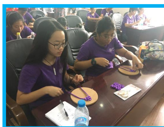
YGL 2017 Students learning the Chinese knot