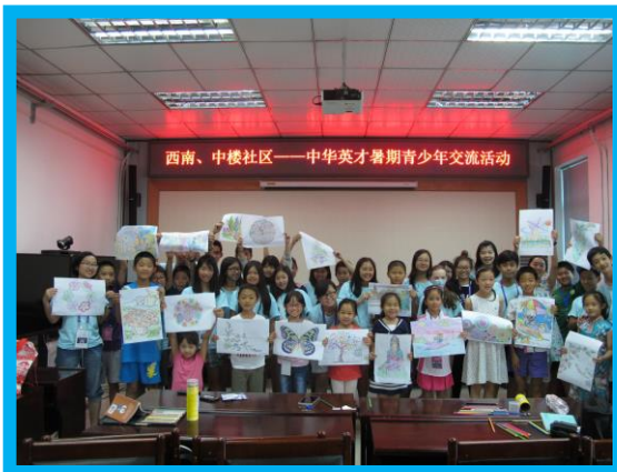
YGL 2015 Group Photo at the community service