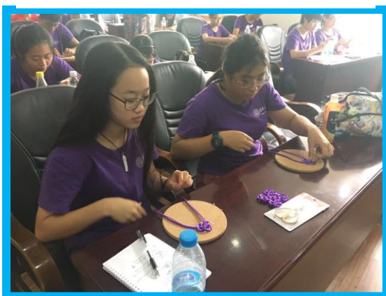
YGL 2017 Students learning the Chinese knot