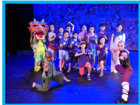
YGL 2016 Students enjoyed the Kung Fu show