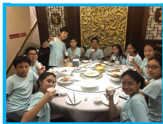
YGL 2018 Students have a Taste of Beijing