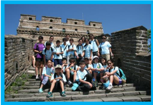
YGL 2012 Students visiting the Great Wall

为了推广汉语教学和中国文化，促进学术交流，加强学生在跨文化及专业方面的国际交往，北京语言大学为海外学生开设了了‘中国文化与普通话（汉语）课程’。本课程历时 20 余年，为学员创造良好舒适的学习环境，配备优质师资，旨在提高学员的汉语水平，增强学员对中国社会文化的了解，促进国际间的交流与合作。