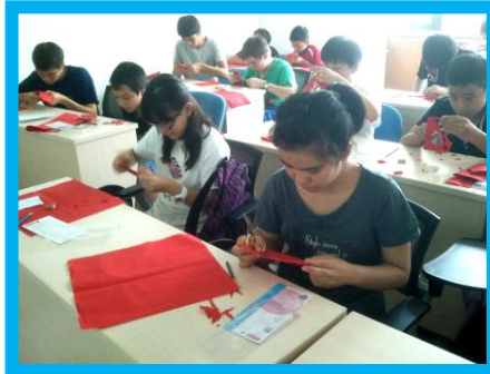
YGL 2013 Students learning paper cutting